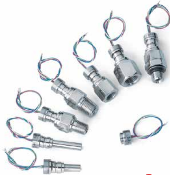
K8 Pressure Transducer