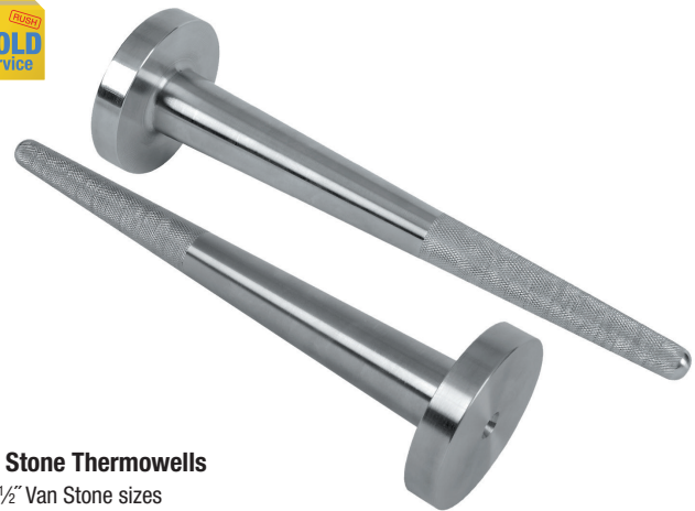
Van Stone Thermowells 1", 1½" Van Stone sizes