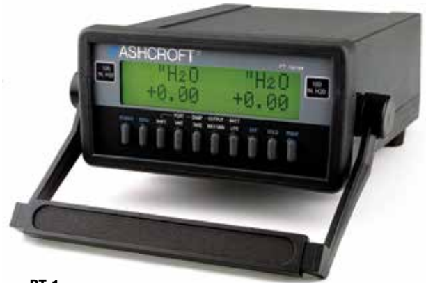
PT-1 Digital Pressure Indicator