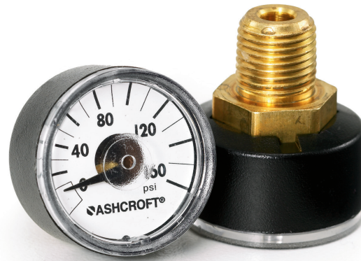
23DDG 0.906" (23 mm) dial size